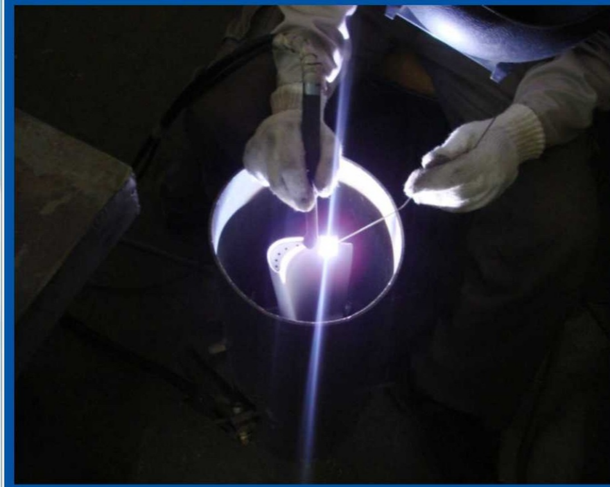
• Welding on First Stage Bucket MS 9001E using WRAP process

One of PT. ALBANY's Advance Repair Rechnology.